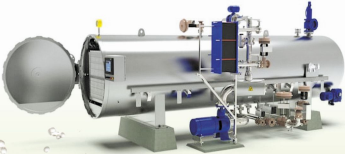
TENDER COCONUT WATER PROCESSING PLANT