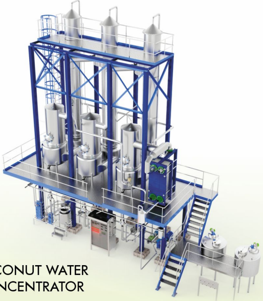
COCONUT WATER CONCENTRATOR