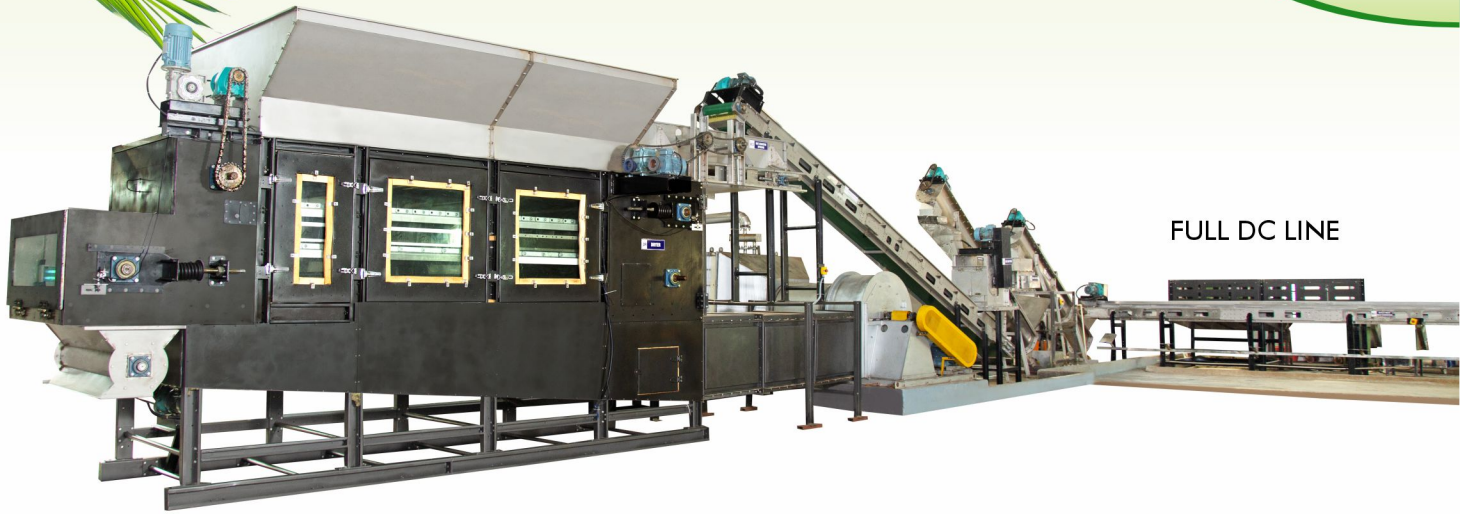
FULL DC LINE