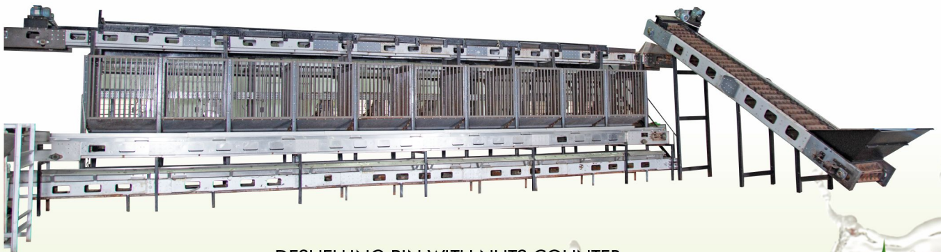
DESHELLING BIN WITH NUTS COUNTER