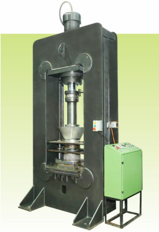
VCO HYDRAULIC COLD PRESS